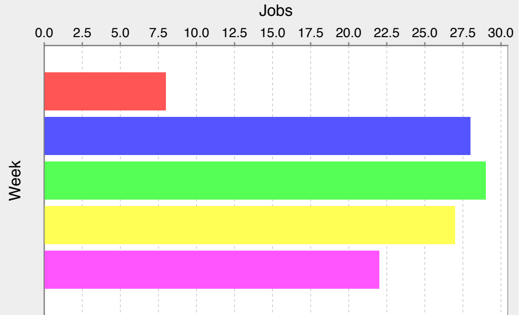
Total jobs by week

■ Week: 31 ■ Week: 32 ■ Week: 33 ■ Week: 34 ■ Week: 35